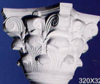
M13 Φ200 320X320X300