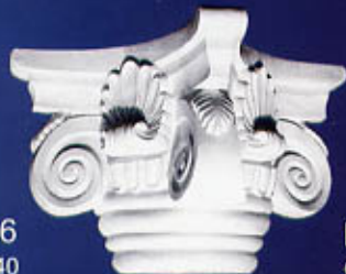
M06 Φ240 520X520X410