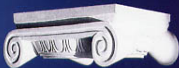
M11 Φ320 390X390X100