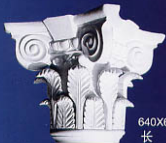
M01 Φ320 640X640X600 长 宽 高