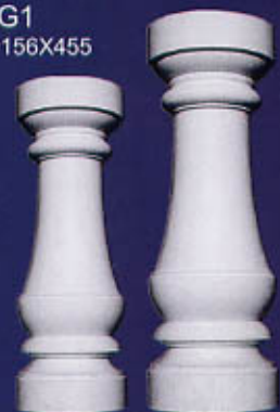
M200J M250J M300J