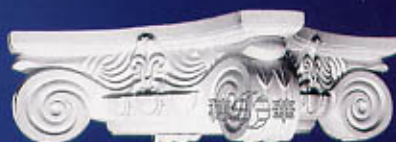
M17 Φ400 660X660X200