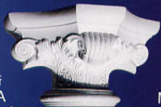
NEW新 M02A Φ240~Φ280 560X560X350 M02 Φ150~Φ200 400X400X250