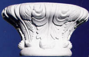
M15 Φ150 Φ280X160