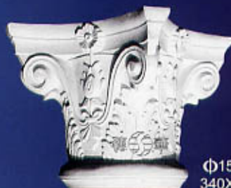
M19 Φ150~Φ200 340X340X290