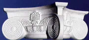
M12 Φ150~Φ200 350X350X150