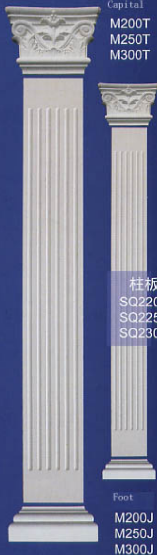
Capital M200T M250T M300T