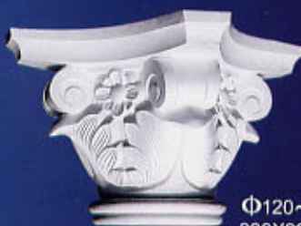
M05 Φ120~Φ150 330X330X250